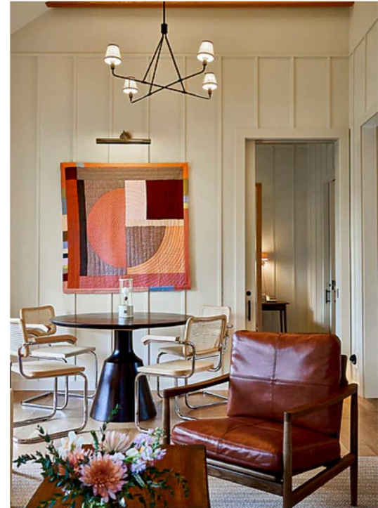
Interior of new River Cottages at Troutbeck, designed by Champalimaud.