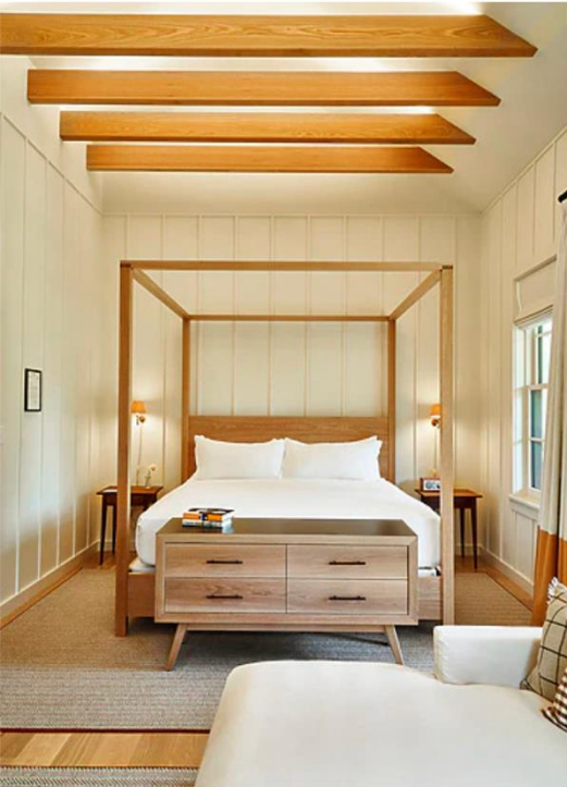
Interior of new River Cottages at Troutbeck, designed by Champalimaud.